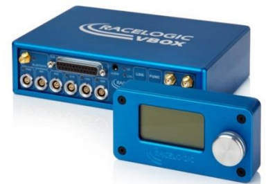
VBOX3iSL-RTK with VBOX Manager

“Moving Base” now allows vehicle separation testing to be conducted on the open road with relative positional accuracy between subject and target vehicles at +/-2cm, without the need for a DGPS Base Station. Correctional messages are transmitted from one specially configured VBOX following the target vehicle, removing the range restriction imposed by the use of a static Base Station.