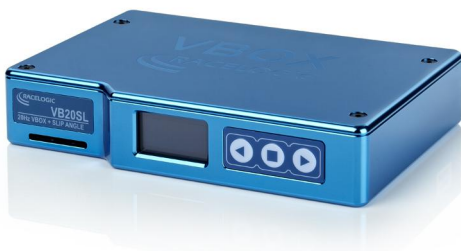
RLVB2SX5 / RLVB2SX10 / RLVB2SX20