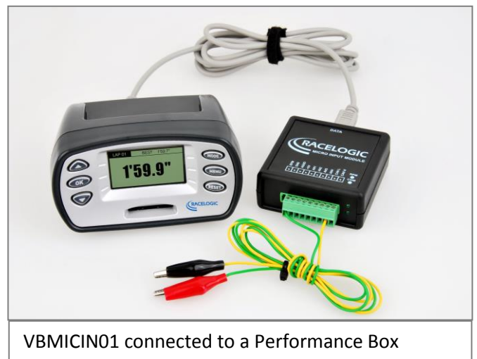
VBMICIN01 connected to a Performance Box